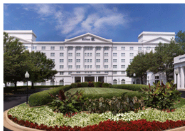
Hilton Atlanta/Marietta Hotel & Conf Center 500 Powder Springs St, Marietta, GA 30064 (About 2 miles from conference venue)