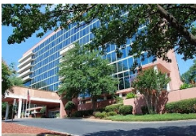
Radisson Hotel Atlanta NW 1775 Parkway Place SE, Marietta, GA, 30067 (Less than a mile from conference venue)

Special hotel discounted rates (at least for two hotels) will be secured for DCA 2020 registered participants at a later date. Tentative 2020 DCA Conference Hotel Options will be Hilton, Radisson, and Marriott (Renaissance Waverly), all within 1 to 6 miles from conference venue. Free shuttle services from conference hotel to conference venue will be provided at scheduled times. Please visit conference website at www.dcaconference2020.org for updated information on hotel options.